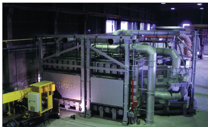
Fig. 3: MultiMelter® BAGR Aluminium- verwertung GmbH in Berlin, Germany

up to 210 °C, which is suitable as filter inlet temperature. The energy saving amounts up to 62 % in relation to a burner system for cool air with a flue gas temperature of about 1400 °C.