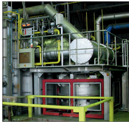
Fig. 4: ECOREG ® -Regenerator BAGR Aluminiumverwertung GmbH in Berlin, Germany

The pyrolysis gas is formed in the Pyrolysis Chamber (2) (Scrap Chamber).